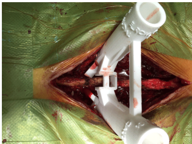
Figure 2: The 3D-printed tubular guide applied into the surgical wound.

(diameter and length) or convert the intervention to the classical technique.