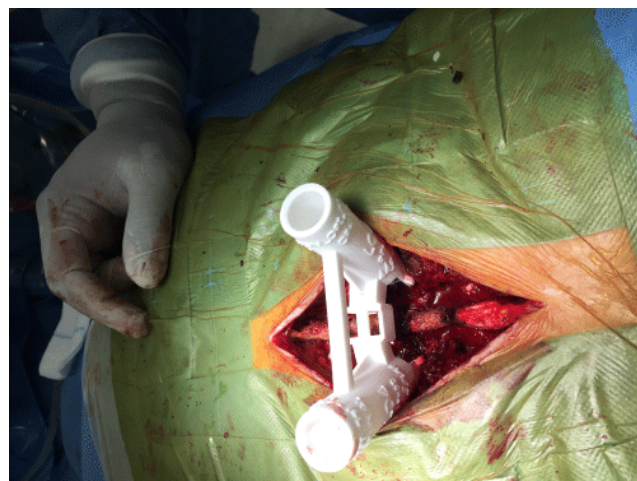
Figure 1: The 3-D printed tubular guide applied into the surgical wound.

The surgeon, constantly connected with the digital platform of the producing firm, can modify each parameter of the planning, varying the trajectory of insertion, incrementing or reducing the diameter and/or the length of the screws, according to personal preferences, until he decides a final planning.