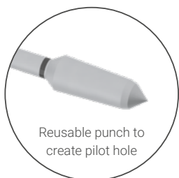
Reusable punch to create pilot hole

ANCHOR BODY The interference between the surrounding bone and the ribbed anchor body increases pull-out strength